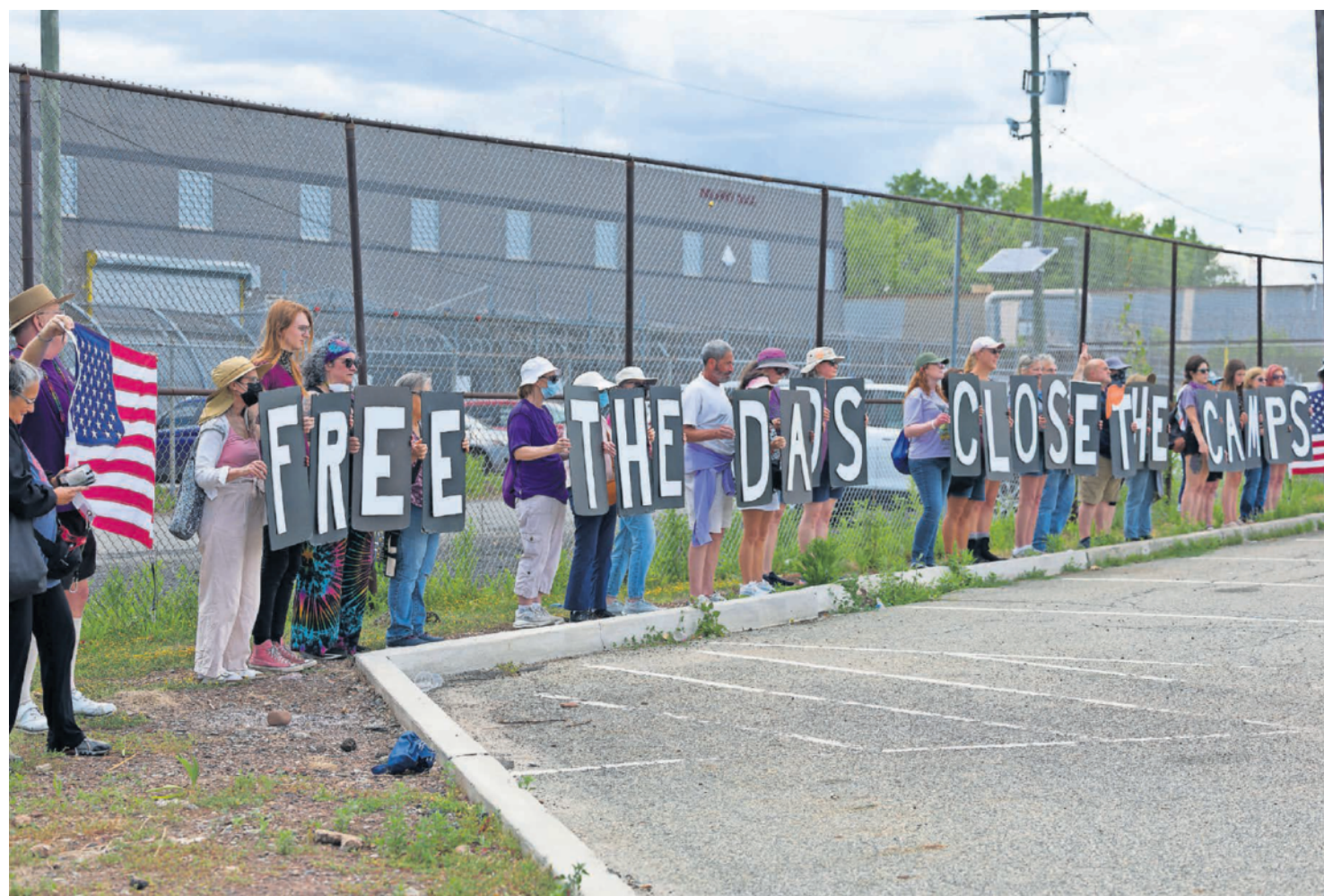
Members of the Visibility Brigade hold demonstrate Sunday outside Delaney Hall in Newark.

Holiday sees a renewed focus on family as protesters continue rallies outside Delaney Hall.