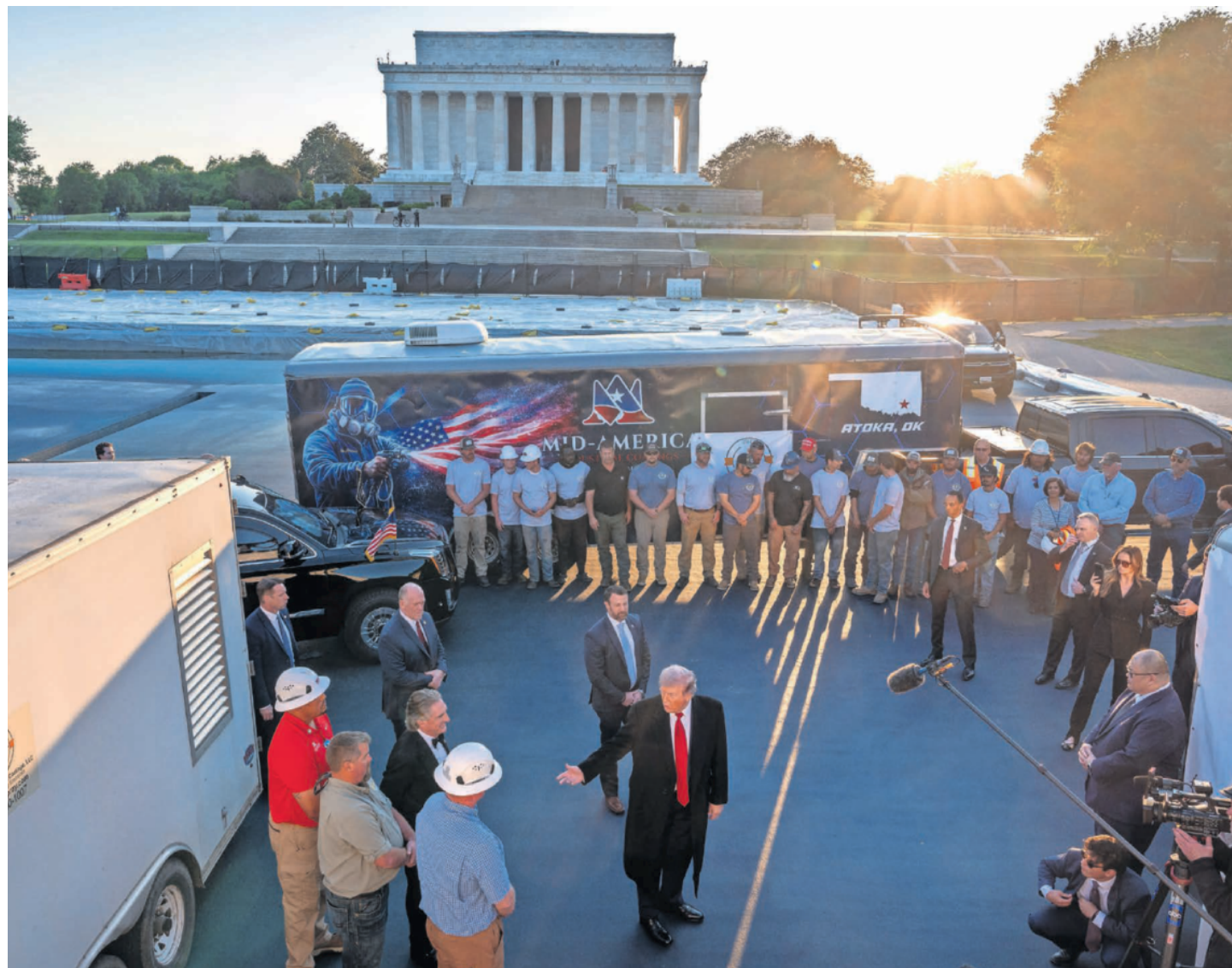
President Donald Trump visits the Lincoln Memorial Reflecting Pool in Washington last week.

From repainting the Lincoln Memorial pool to eyeing a public golf course, the president is reshaping the capital in his own image.