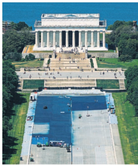
Trump ordered that the Reflecting Pool be repainted a color he described as “American flag blue.”

The project has been on his mind lately. During an hour-plus speech Monday to small-business owners, Trump spent about nine minutes talking about the paint job, detailing the granite floor and boasting that he whittled the renovation’s cost to $1.9 mil-