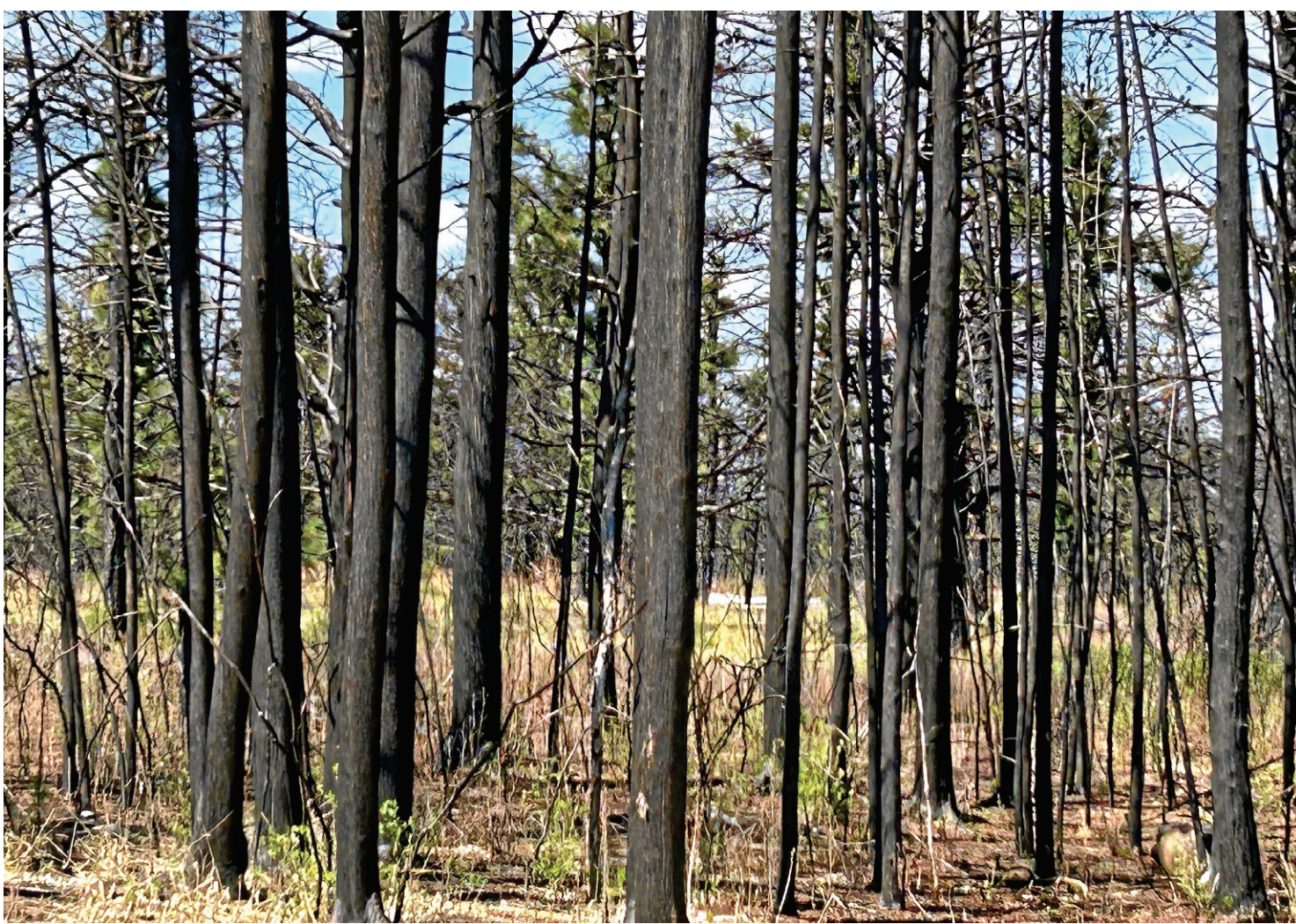
WAYNE PARRY, STAFF WRITER

This April 20, 2026, photo shows charred pine trees at the edge of an industrial park in Lacey Township that were burned in a forest fire April 22, 2025. The blaze burned 15,300 acres and destroyed one business in an industrial park, but otherwise spared lives and property.