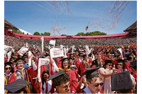
Students cheer after graduating from Rutgers in Piscataway on May 17. Engineering students at the school saw their planned commencement speaker disinvited because of objections to his comments on Israel.