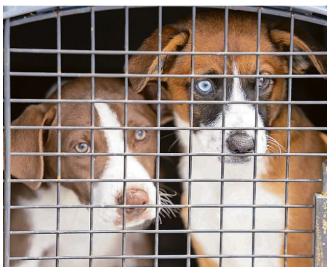
Rescued dogs sit in their crate after they arrived from New Orleans.