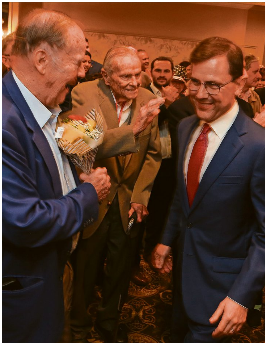
Former Gov. Tom Kean, left, with his son Tom Kean Jr., who came out for his 7th Congressional District victory speech on Nov. 5, 2024, at the Republican Election Night celebration in Bernardsville.