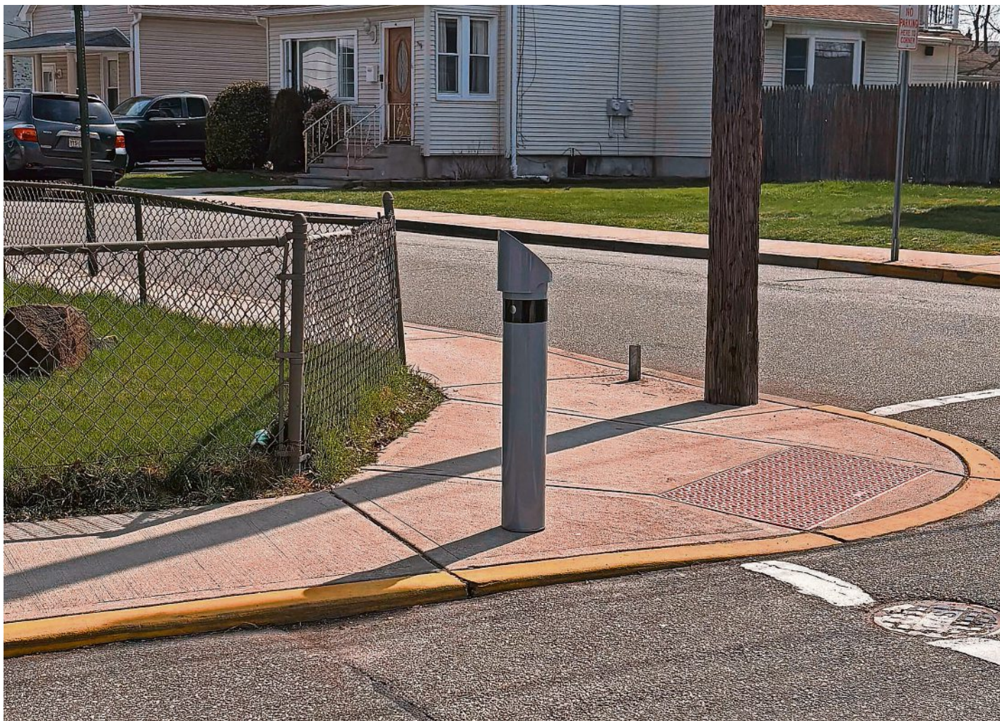
A SafetyStick device that has been installed at the intersection of Grove Street and Marshall Avenue in Little Ferry.