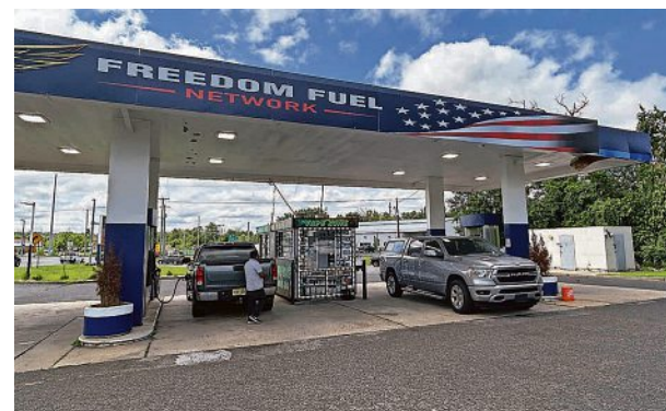
Freedom Fuel was busy on a recent morning. The West Berlin, New Jersey station was offering gas at $3.47 a gallon, cheaper than most other stations in the area.