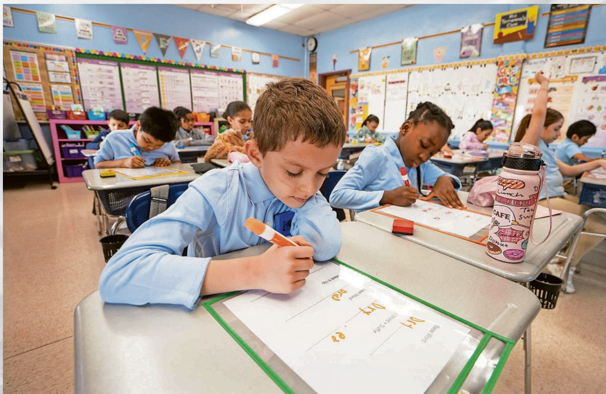
A student works on a reusable worksheet in a third grade classroom during a lesson focusing on English language arts using phonics-based instruction at Columbus Elementary in Lodi on March 27.