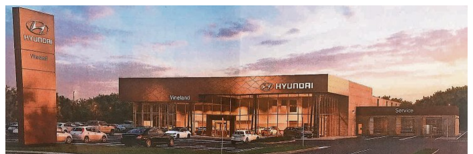
A rendering of a proposed building for a new Vineland Hyundai dealership site at 3565 S. Delsea Drive in Vineland. Redcom Design & Construction LLC prepared the rendering.