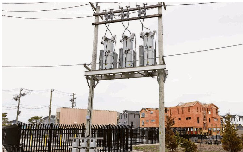
The 2 megawatt-hour battery storage system is the first of its kind in Atlantic City Electric's service region, according to the power company.