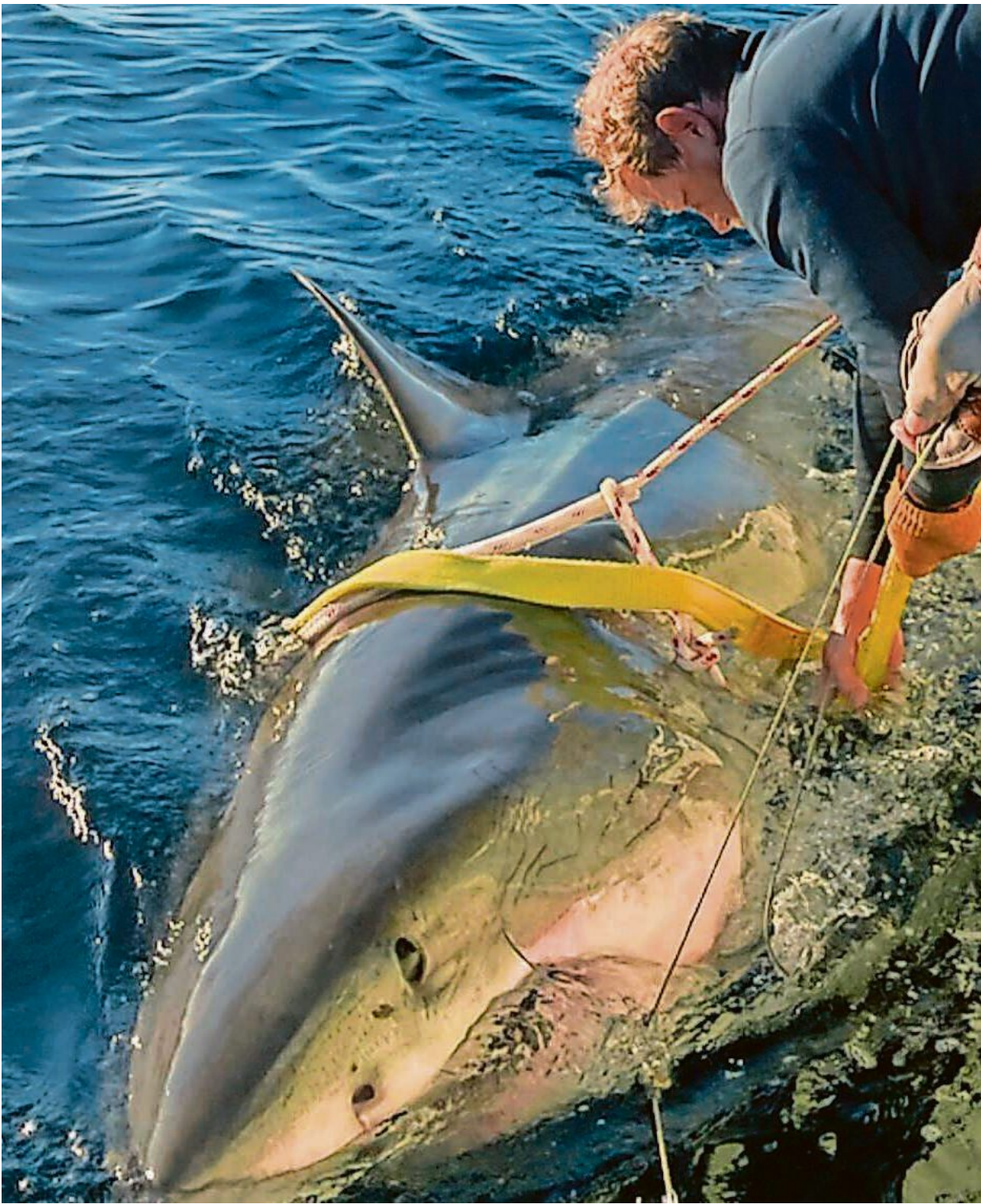
Contender, the largest male great white shark tagged by OCEARCH, is seen here during its brief capture off the coast of Florida and Georgia on Jan. 17.