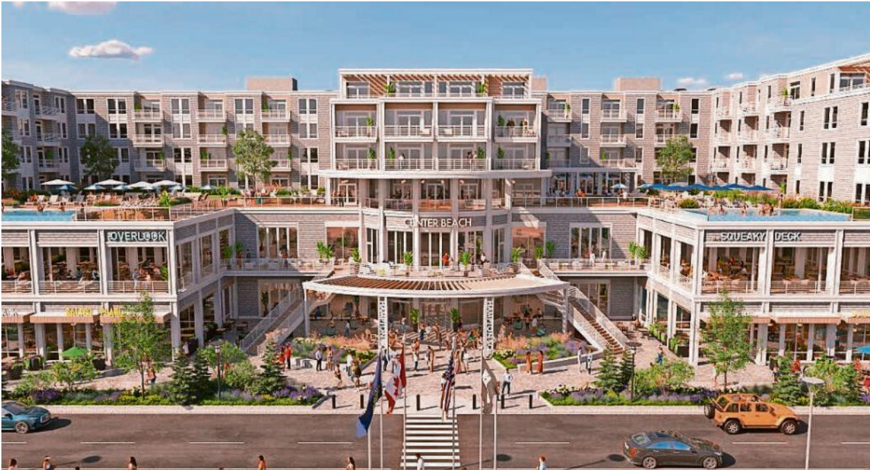
The proposed redevelopment of the Hampton Beach Casino property includes a year-round complex featuring a music venue, hotel, condominiums, restaurants, retail shops, and charitable gaming.

OUR SHARED COMMUNITY PRINT-ONLY SUBSCRIBER-EXCLUSIVE SPECIAL SECTION Capturing America's Stories with the Smithsonian