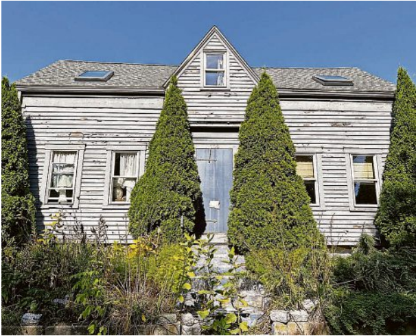
The owner of a home at 109 Dennett St. in Portsmouth is asking the city to move her home out of the historic district after she was denied a request to install vinyl siding.