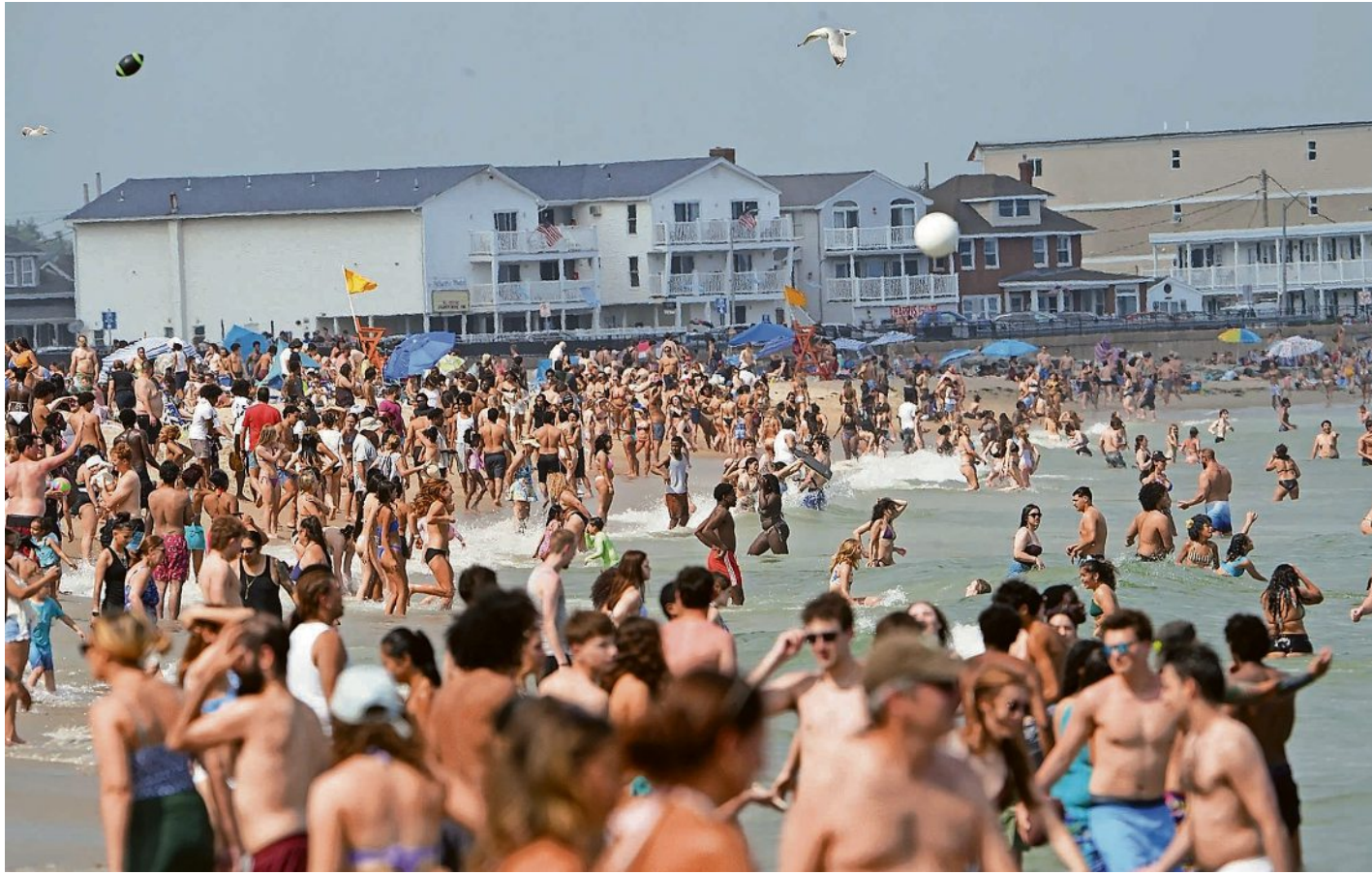
Crowds packed Hampton Beach during a hot and humid day on May 19.