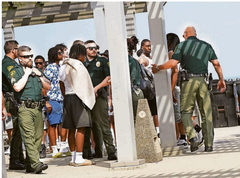
State and local police maintained a strong presence at a crowded Hampton Beach on May 19.