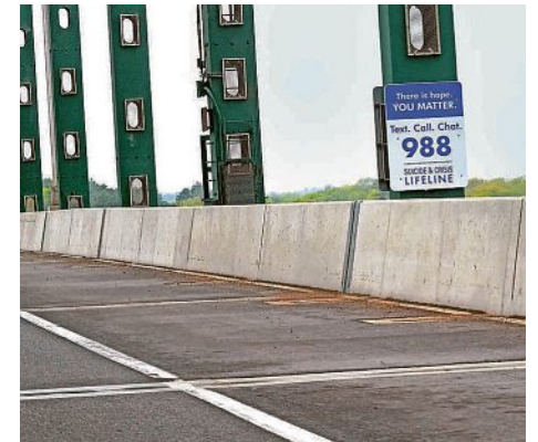
A sign on the Piscataqua River Bridge reminds people that help is available for anyone experiencing a mental health crisis.