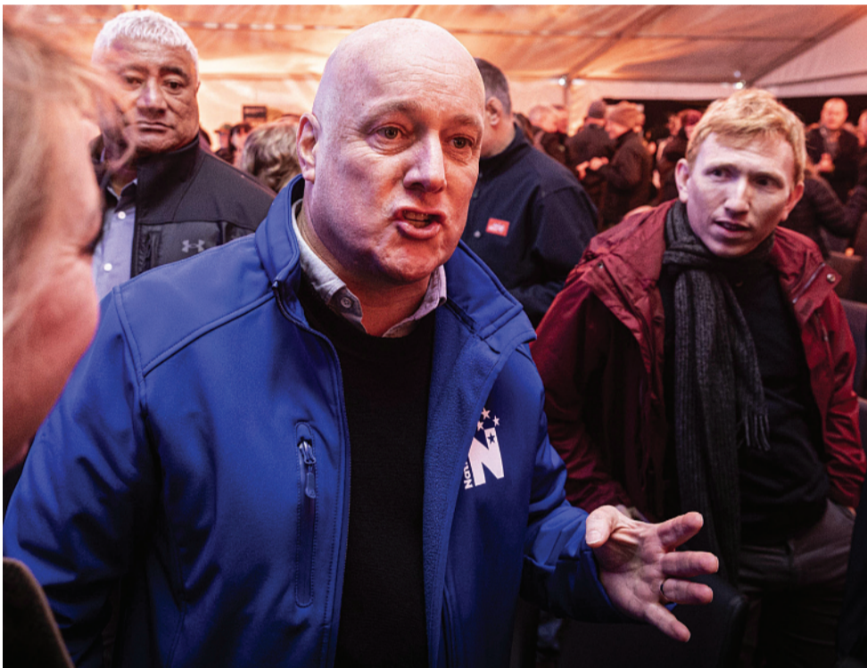
Prime Minister Christopher Luxon saw a three-point lift in the preferred prime minister stakes since February, to 37%, still below Chris Hipkins on 44%. WAIKATO TIMES

The Post/Freshwater Strategy's latest poll shows the National Party stranded below 30%