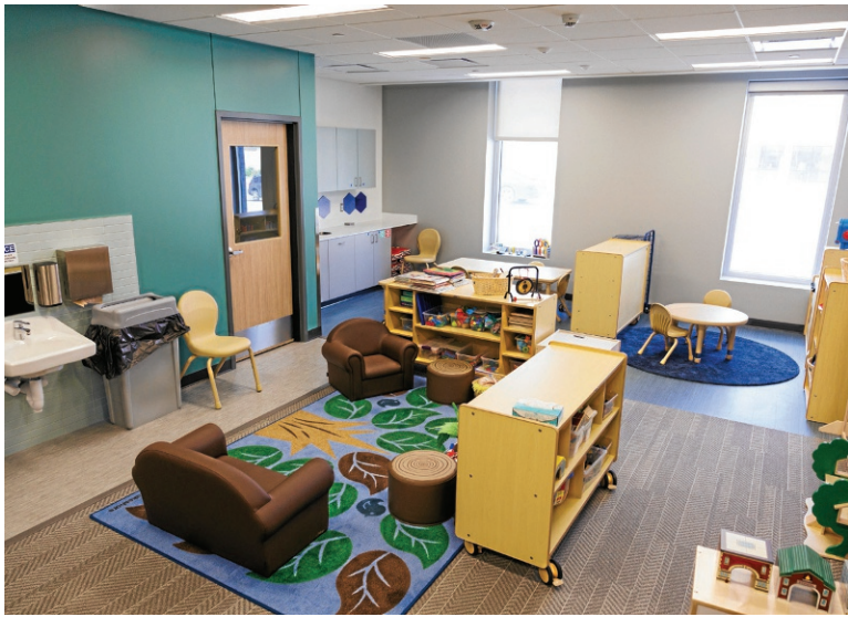
A look inside a classroom Tuesday at the Child Saving Institute. The institute will maintain services at its main Mary Holland campus in Omaha while also continuing to keep the Children's Square campus active near Avenue G and Kanesville Boulevard in Council Bluffs.