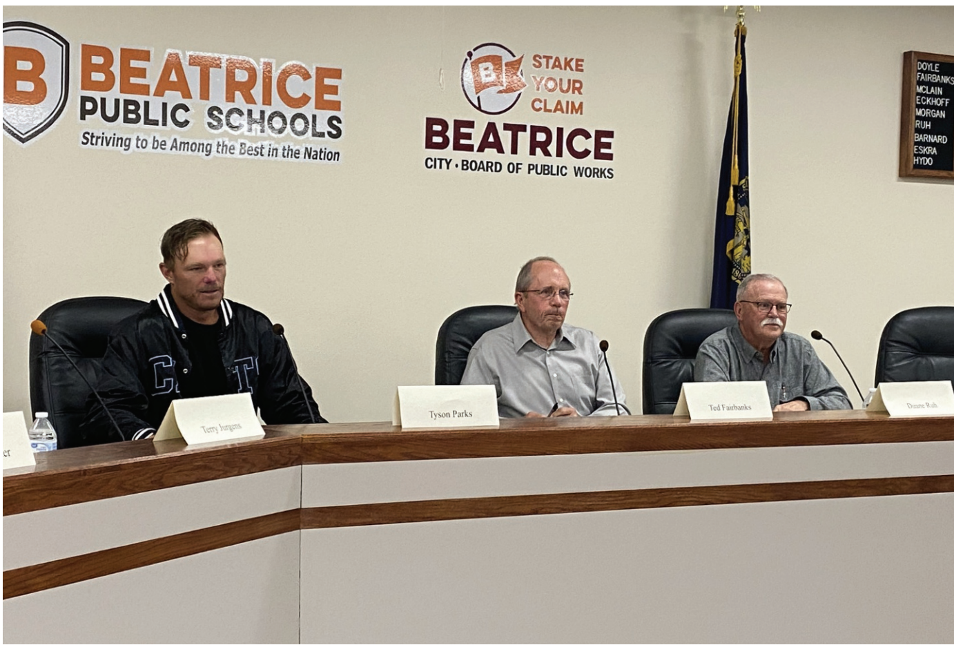
CHRISTINA LYONS, DAILY SUN