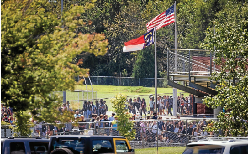
Reagan High School students walked out of class on Monday in support of teachers.

Hundreds of students across several high schools walked out of class on Monday, a reaction to the mass layoff of educators currently happening in Winston-Salem/Forsyth County Schools. The school board voted last week to lay off up to 275 people and eliminate about 350 positions, a move that will save the school district $18.2 million. Interim Superintendent Cathy Moore said that without the cuts, the school district would be unable to pay its bills and make payroll in October.