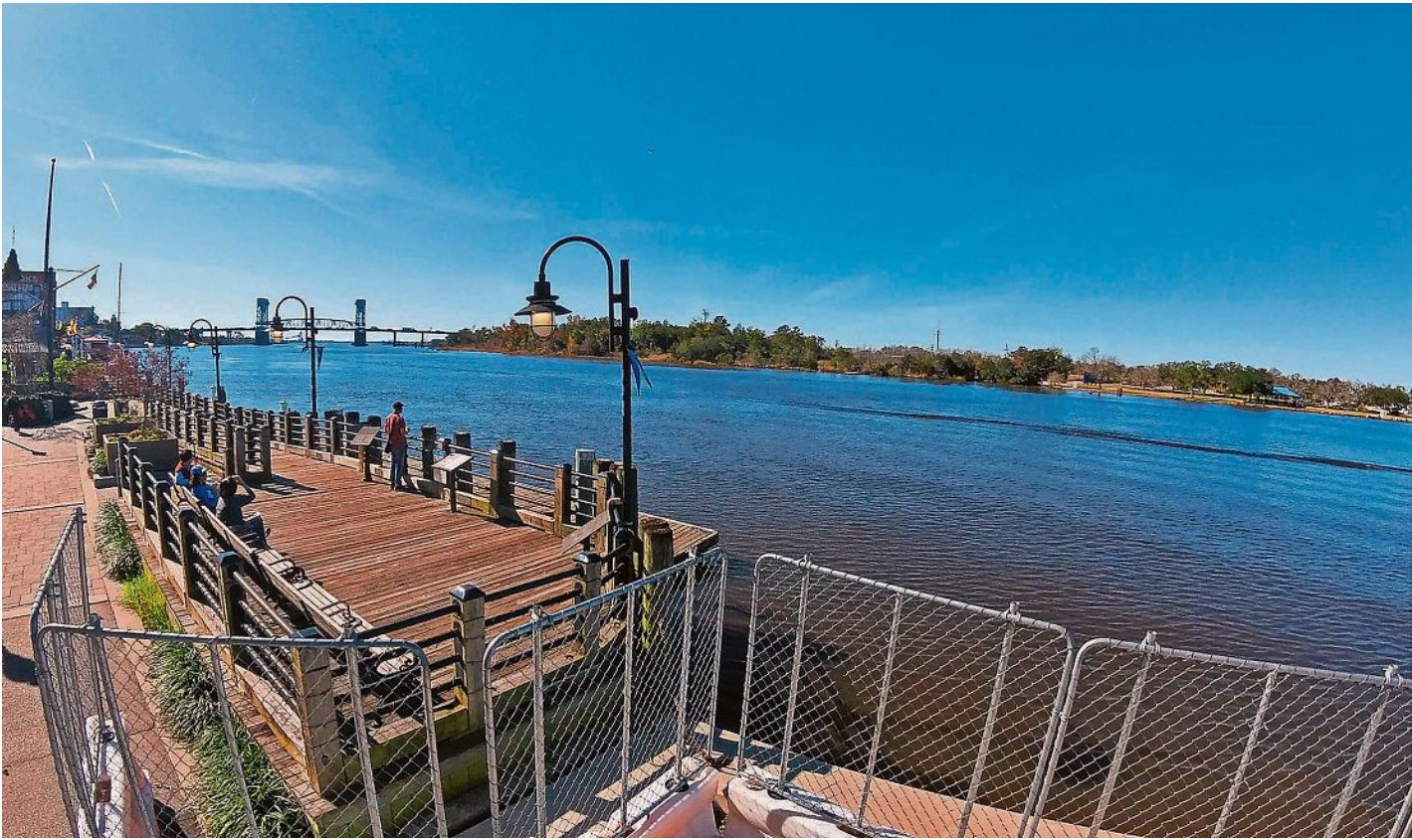
Work continues on Nov. 5 along the Riverwalk in downtown Wilmington.