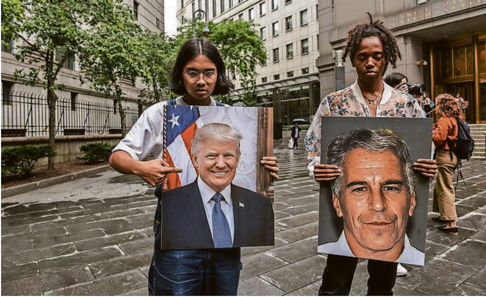
Newly released correspondence with the late Jeffrey Epstein show the degradation of his relationship with President Donald Trump, in which he called Trump "borderline insane."