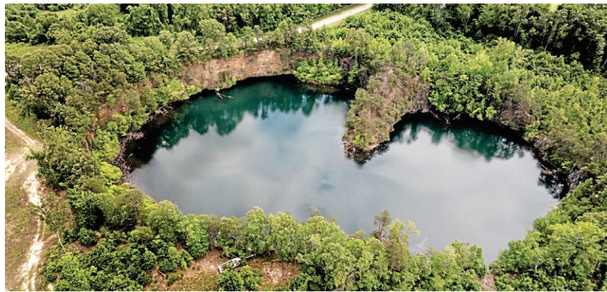
WALT UNKS, JOURNAL

For example, the so-called "friction ridges" on the skin of the fingers sloughs off after a few days of submersion in water, destroying a vital method of identification.