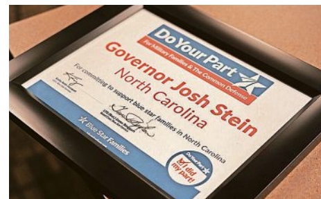
Gov. Josh Stein was in Fayetteville on Aug. 7 to announce North Carolina is joining a national effort to improve support for military families.