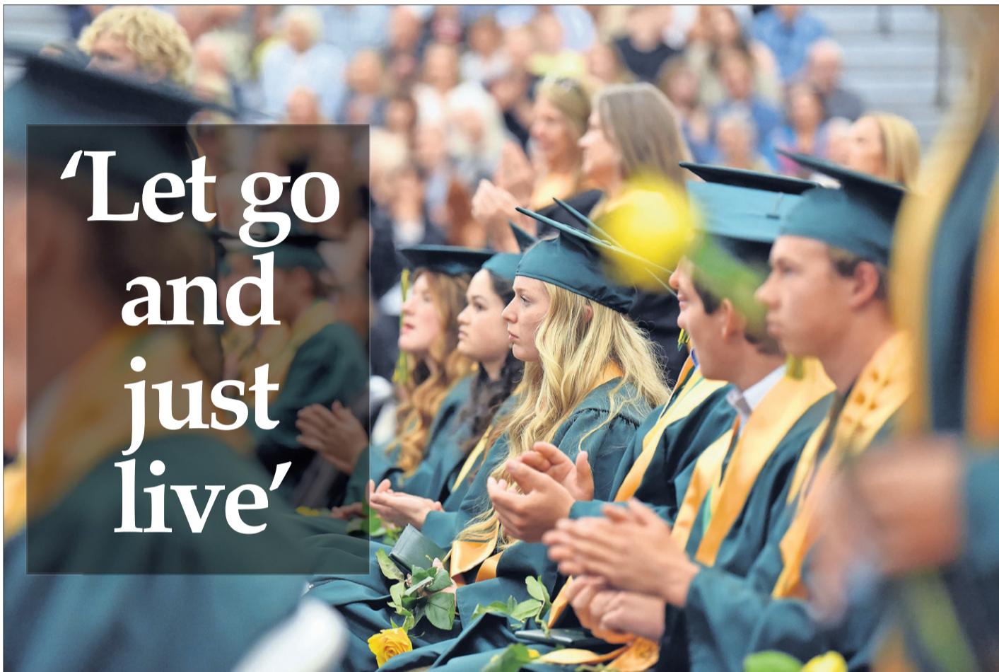
Whitefish High School Class of 2026 graduates on Saturday, June 6.