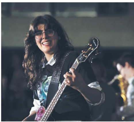
Capital High's Sk@zz hits the stage with songs from Reel Big Fish during the first annual Big Blue Battle of the Bands on Saturday night at East Helena High School.