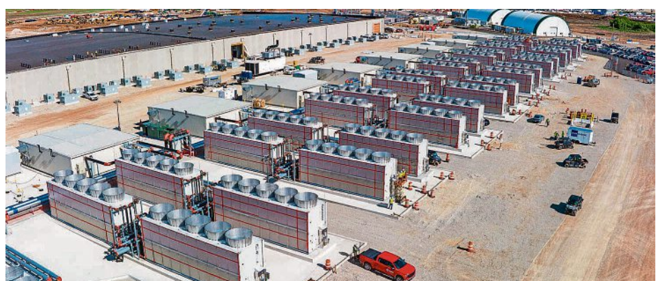
Gallup survey results found 70% of Americans oppose the construction of data centers in their communities.