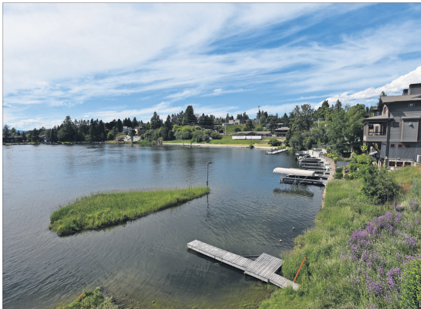
A VIEW of Bigfork Bay on Flathead Lake where developers have proposed to build a marina on June 24, 2026.