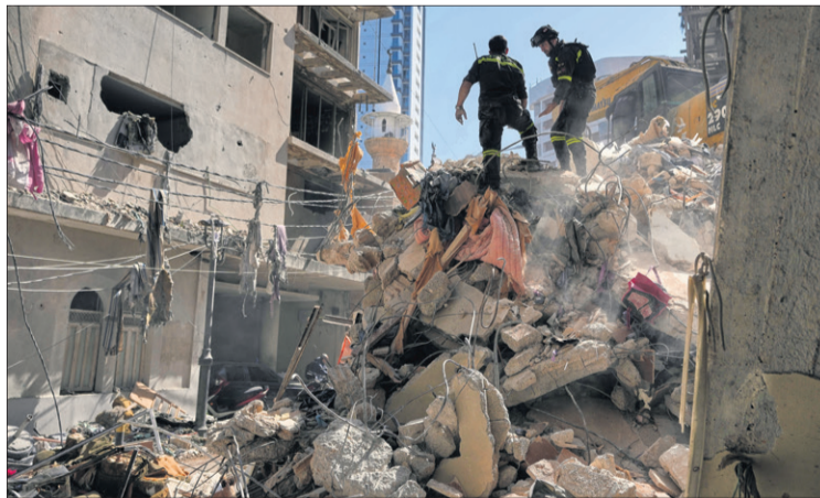
LEBANESE CIVIL defense workers inspect the rubble at the site of a building destroyed in an Israeli airstrike a day earlier in Beirut, Lebanon, Thursday, April 9, 2026.

and Netanyahu later stressed that there was no ceasefire between them. In a video statement, he said Israel will keep striking Hezbollah until security is restored in northern Israel. There was no immediate response from Lebanese authorities. But Israel-Lebanon negotiations were expected to begin next week at the State Department in Washington, according to a U.S. official and a person familiar with the plans who both spoke on condition of anonymity due to the delicacy of the matter.