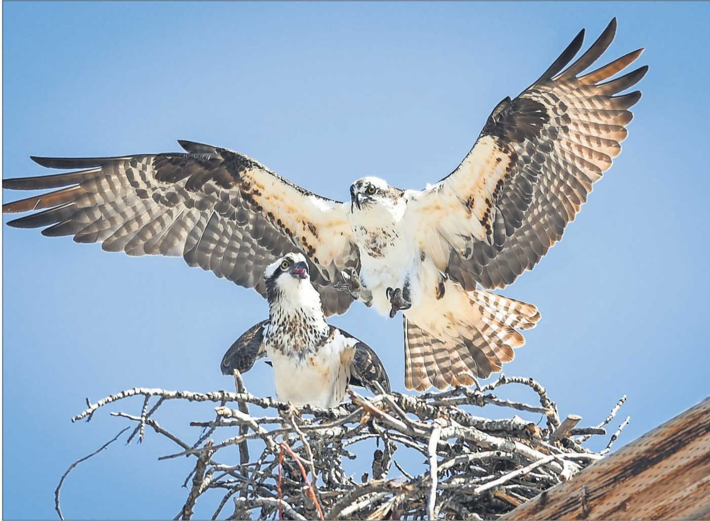
A PAIR of ospreys nest above the Flathead River in 2021.