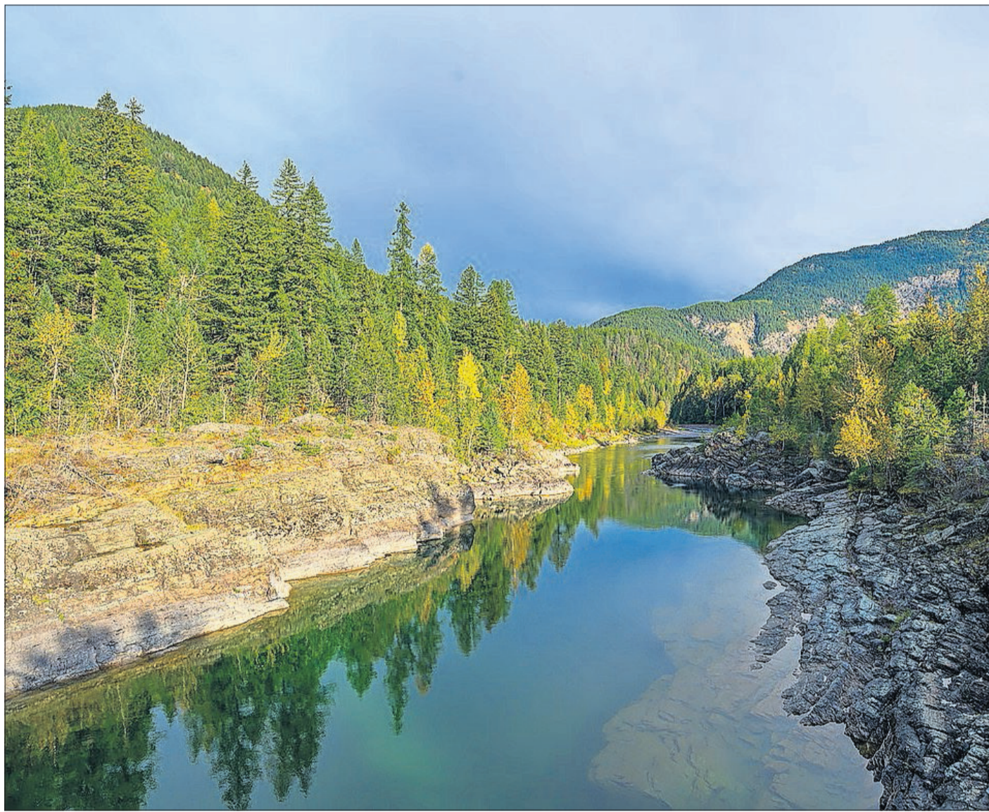
THE MIDDLE Fork of the Flathead River at West Glacier last week.