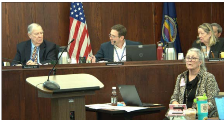
The Kansas Corporation Commission, shown here in a June 2025 hearing, recently set limits on Evergy's construction of a transmission line, stopping it from crossing prairie grasslands in south-central Kansas.