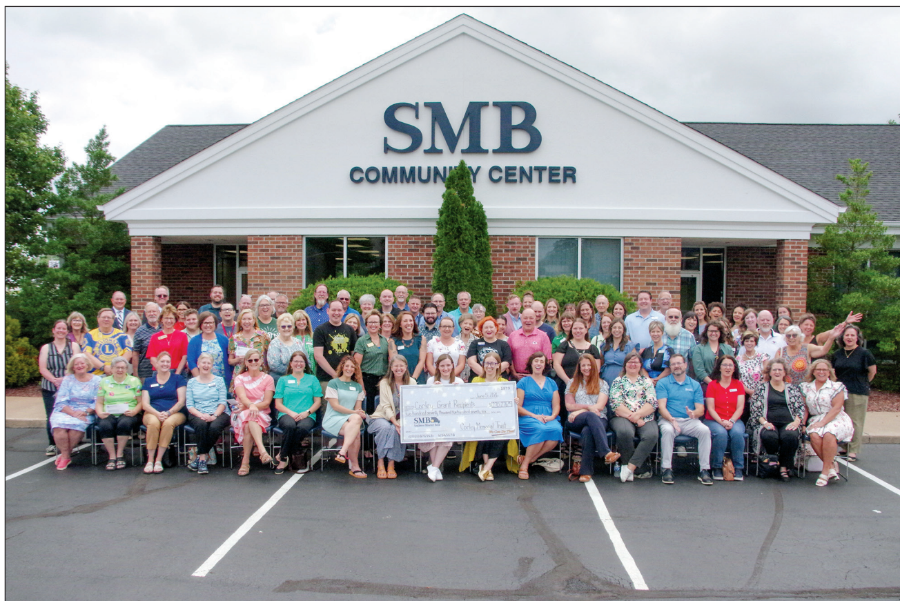
Representatives of many of the 72 groups that received grants from the W.R. Corley Memorial Trust gather Friday for a group photo.