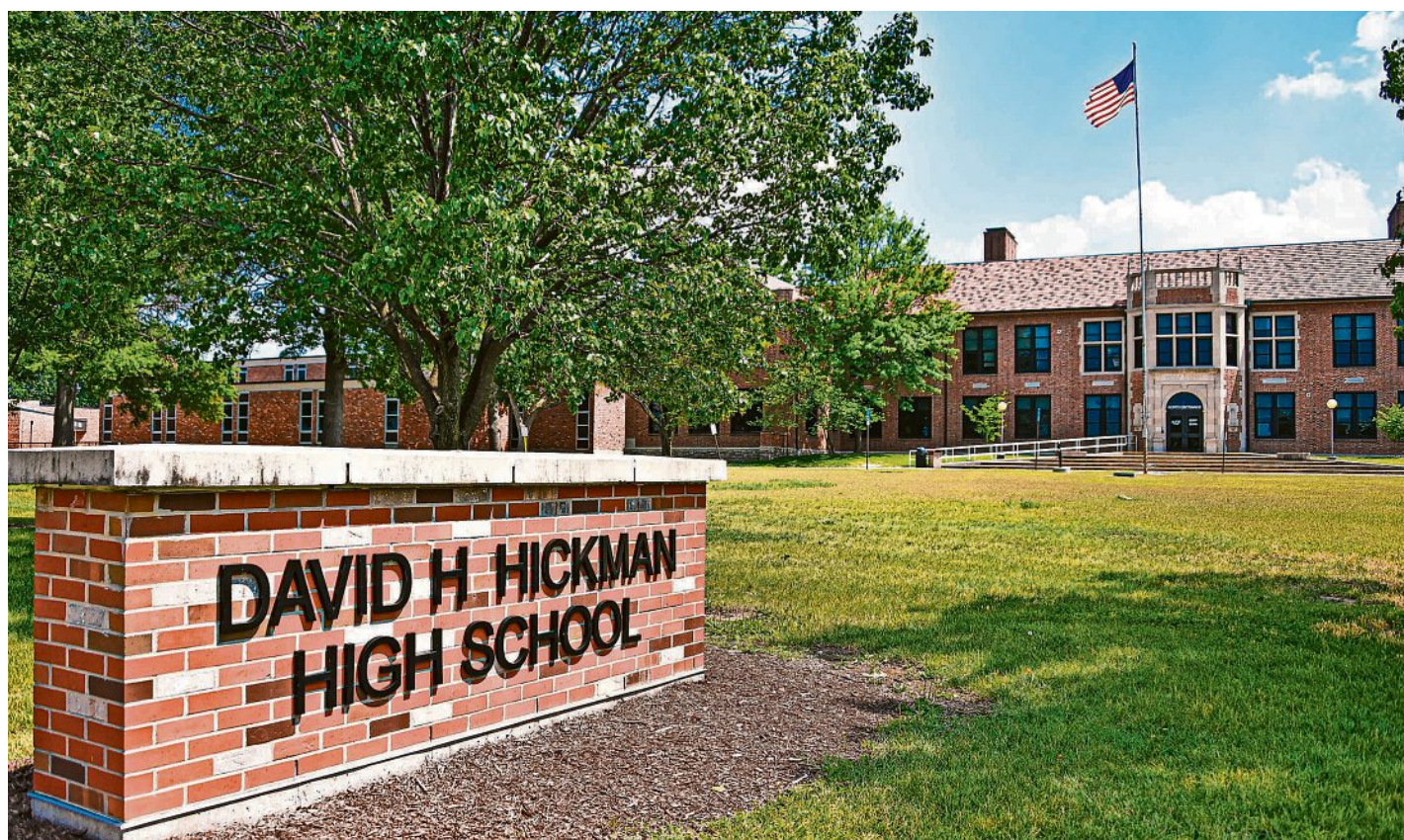
The cornerstone for Hickman High School was placed in a Sept. 16, 1926 ceremony, with the building officially opening about a year later, Sept. 19, 1927.