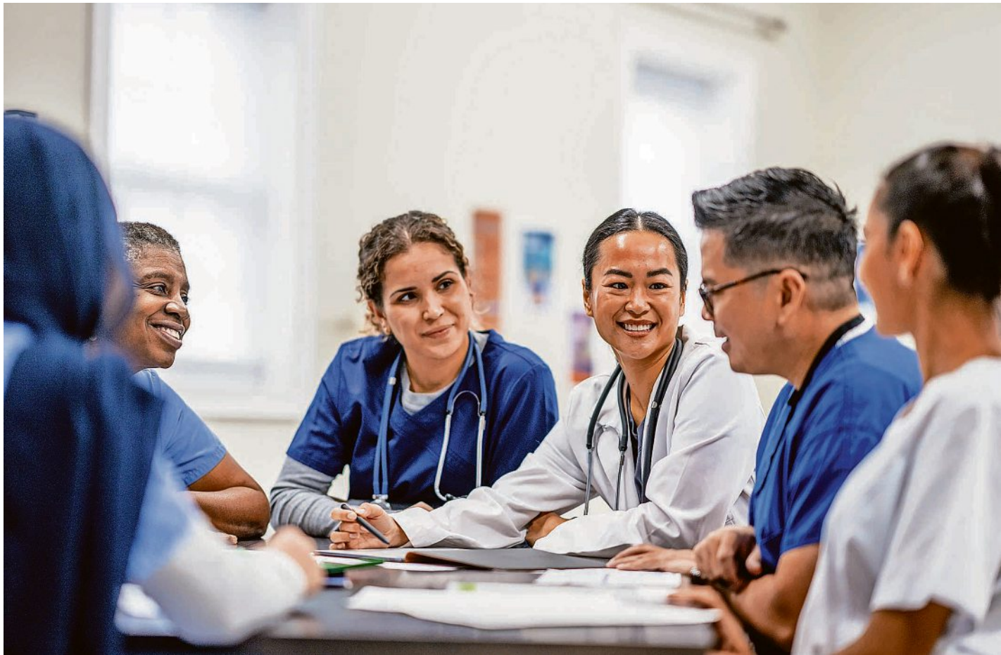
The share of doctors who belong to unions rose from 5.7% in 2014 to 7.2% in 2019. By 2024, an estimated 8% of physicians were union members.

SERVING ST. JOSEPH COUNTY | PART OF THE USA TODAY NETWORK