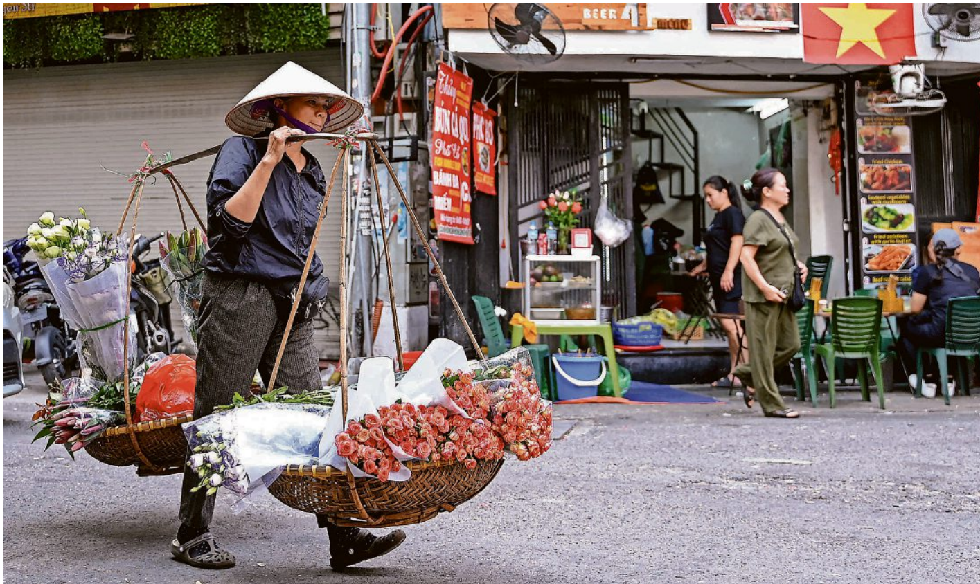
A street vendor carries bouquets of flowers for sale in Hanoi, Vietnam, on Oct. 22. Countries with “demographic dividends” such as Vietnam, with 70% of the population ages 15-64, have the opportunity for impressive growth rates.