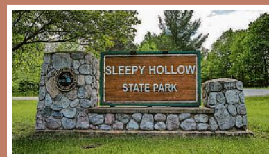
Sleepy Hollow State Park in Clinton County was closed last year for renovations.