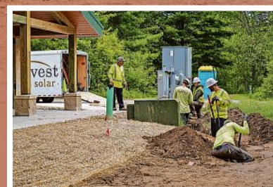
ABOVE AND TOP: Construction by Harvest Solar is ongoing to implement an auxiliary solar array for the new restroom and shower facility at Sleepy Hollow State Park.

O n a cool, sunny morning in mid-May, Sleepy Hollow State Park was living up to its name. • It was quiet enough that a wild turkey skittered across the road as a reporter and photographer walked in the area of the modern campgrounds. A few minutes earlier, a cottontail rabbit foraged in the north campground and a chipmunk scampered across an open area on its daily rounds. • The usual throngs of warm-weather campers at the picturesque, 2,600-acre park northwest of Laingsburg weren't there. A couple of work crews were still in the park, finishing tasks from improvement projects that prompted the Michigan Department of Natural Resources to close the modern campground for all of 2025 and the first part of this year. See SLEEPY HOLLOW, Page 2A