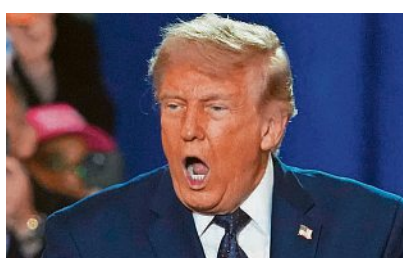
President Donald Trump has said a committee overseen by the acting attorney general will determine how to distribute the money.