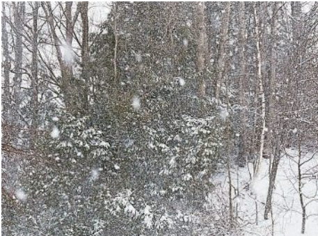
High winds and heavy snow hit northern Michigan during a winter storm on Dec. 29.

Virtually the entire state was left to recover in some way from a powerful “bomb cyclone” winter storm Sunday night through Monday, Dec. 29, that brought wind gusts exceeding 50 mph, more than 2 feet of snow to the Upper Peninsula and dangerous snow squalls causing whiteout conditions throughout southern Michigan. A pileup accident involving nearly 60 vehicles shut down the northbound Interstate 75 freeway at McNichols Road in north Detroit near Highland Park late Monday morning. Michigan State Police announced the freeway had reopened after 4 p.m. Monday. The Federal Aviation Administration issued a temporary halt to flights from