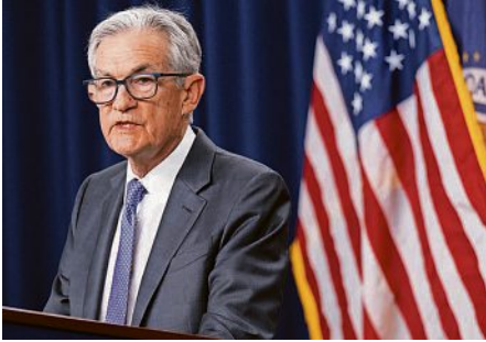
President Donald Trump is poised to pick a new Federal Reserve chair to take over when Jerome Powell’s term ends in May 2026.