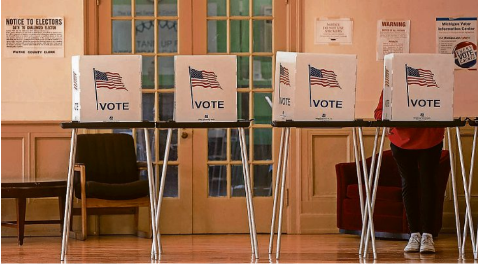
A person wearing a bright red sweater stands behind a voting booth as they cast their vote inside the Central United Methodist Church polling place in Detroit on Nov. 8, 2022.

Michigan voters in 2026 will decide who will serve as the state’s next governor. Past leaders have taken different journeys to the top elected office in the state, but some trajectories have proven more common in the state’s modern political set-up than others. Not every candidate running for governor has experience in elected office, but here’s a look at candidates who do, the elected office they currently hold — or held most recently — and the last time a Michigan governor was in office