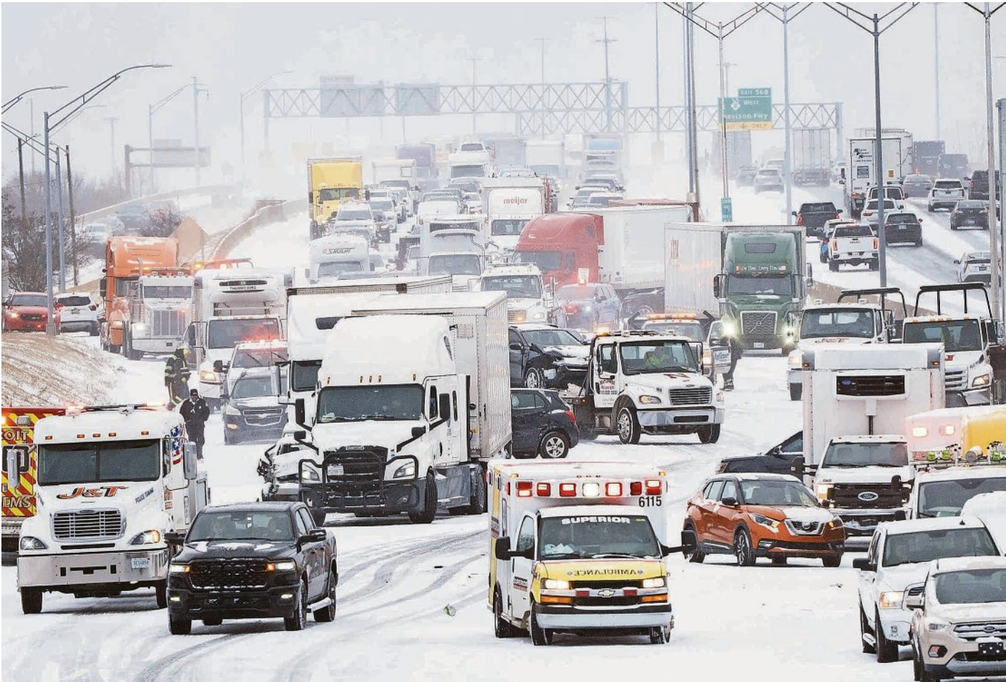
Rescue workers and tow trucks work to help people at a multiple-car pileup on northbound I-75 near Highland Park after snow squalls and strong winds made driving conditions dangerous on the roadways on Dec. 29.