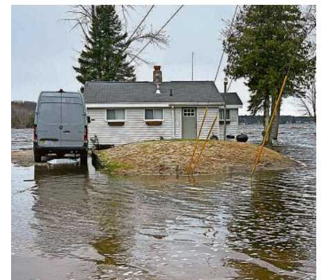
Cottages are surrounded by flood water on Pigeon River Bay in Cheboygan County on April 19.

This story was created with the assistance of Artificial Intelligence (AI). Journalists were involved in every step of the information gathering, review, editing and publishing process. Learn more at https://cm.usatoday.com/ethical-conduct .