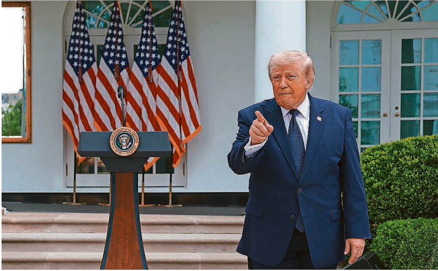
President Donald Trump said in a post that "other Retailers should follow the lead of" Walmart.