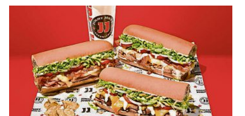
Jimmy John's added three new toasted sandwiches to its menu on March 4: Chicken Bacon Ranch, Roast Beef & Cheddar and Ultimate Italian.