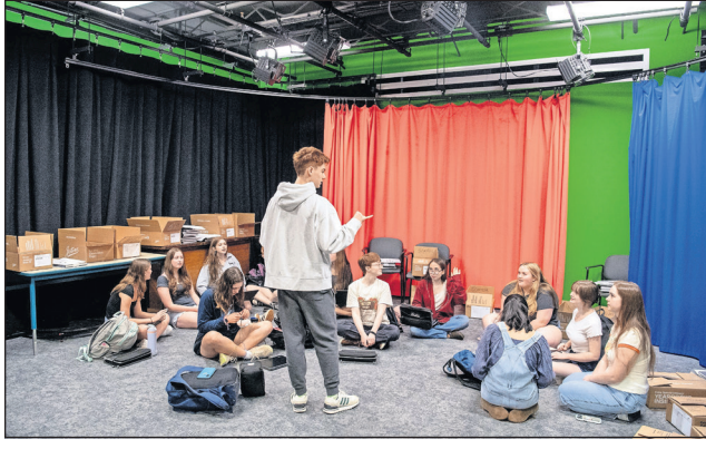
Scarborough High School newspaper students gather for a meeting last summer. The Scarborough School District would lose the most funding under a proposed bill and district leaders were the only ones to speak against it.

A bill to reform the long-criticized Essential Programs and Services formula got support from districts around the state at a hearing Monday. Some said it could go even further in reducing inequities.