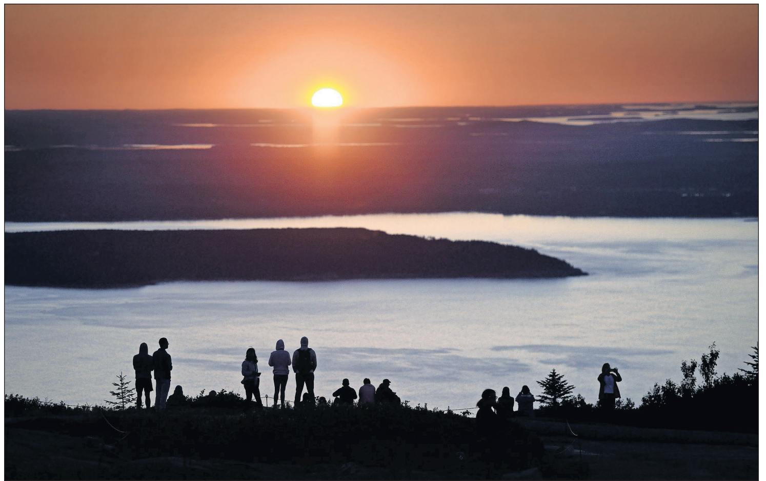
Visitors watch the sunrise at Cadillac Mountain in Acadia National Park in July 2017. Predictions about the coming tourism season "are definitely difficult to make," says the director of the Maine Office of Tourism.