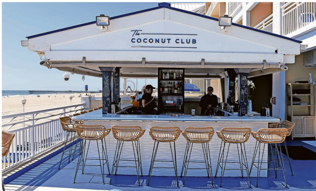
The Coconut Club, above, is located on the second floor of the Park Place Hotel. The bar serves an Adult YooHoo cocktail, below.