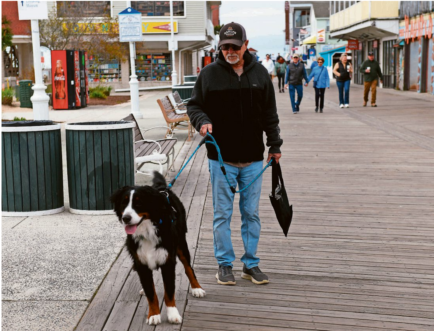
Worcester County Humane Society's 23rd Annual Boardwalkin' for Pets Saturday, April 27, 2024, in Ocean City, Maryland.