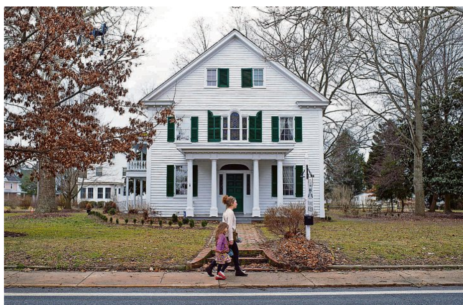
The Calvin B. Taylor House Museum in downtown Berlin is the Worcester County site where Liberty Trees will be planted.

Five regional events will serve as anchor celebrations. The project's kickoff