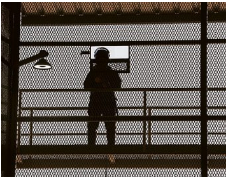
The CECOT detention facility has been used to house some migrant detainees from the United States as part of a deal with El Salvador.