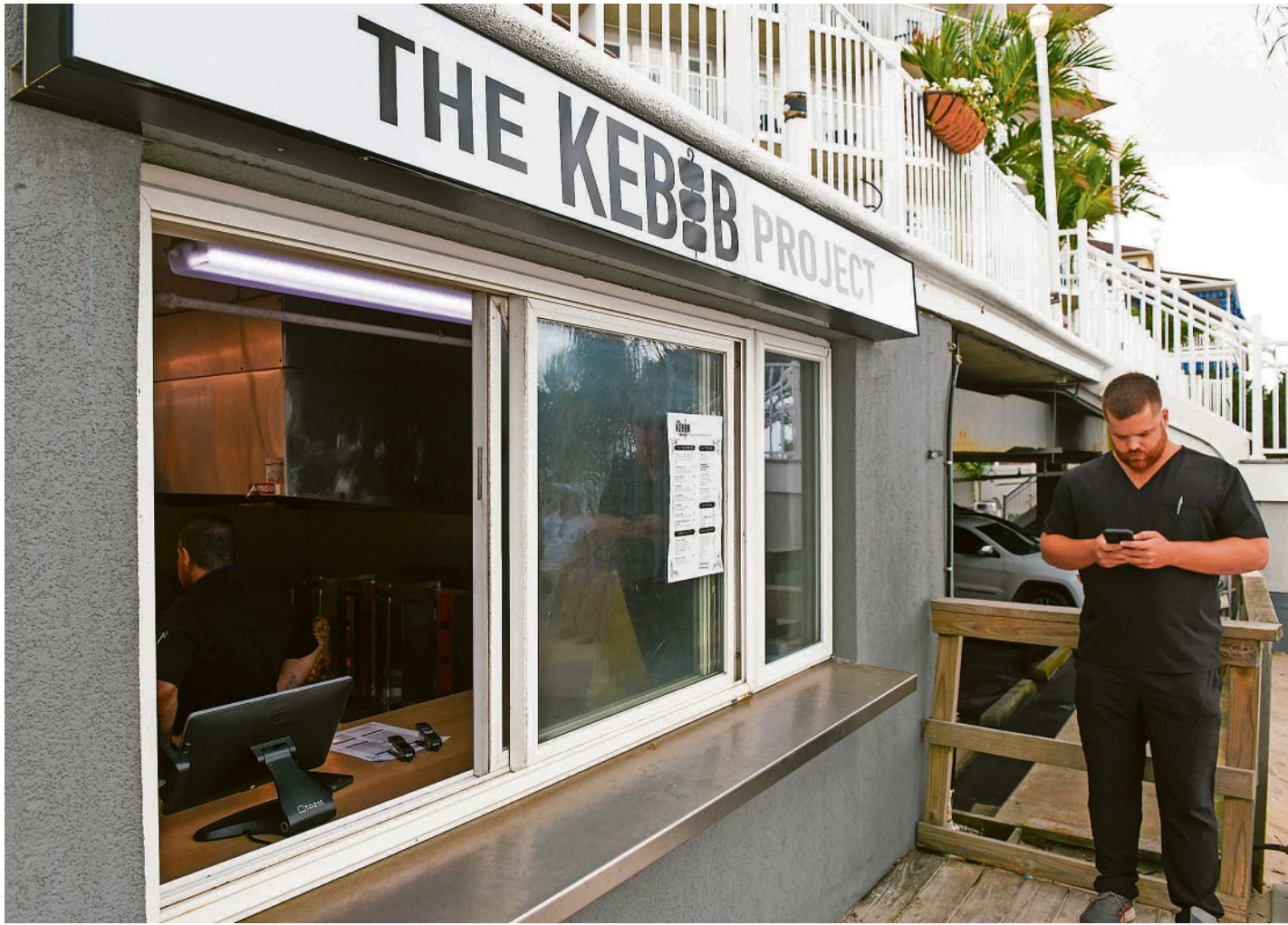
The Kebob Project on the boardwalk at 1401 Atlantic Ave. opened earlier this year in Ocean City on July 7.

WEDNESDAY, DECEMBER 24, 2025 | DELMARVANOW.COM PART OF THE USA TODAY NETWORK