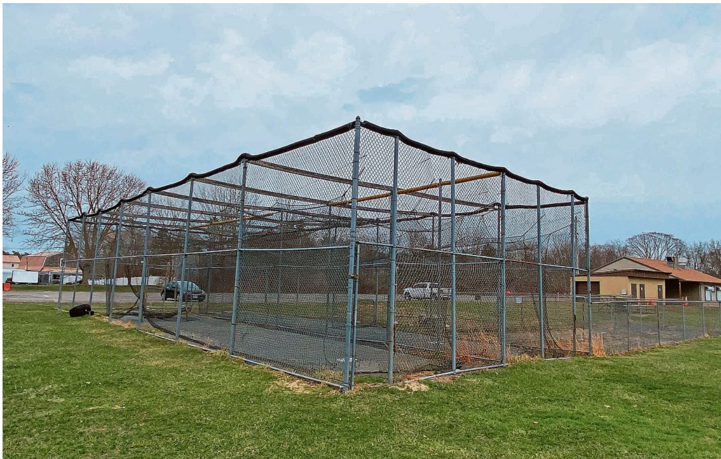
The complex for Taunton East Little League, 629 Middleboro Ave. in East Taunton, will soon be getting its own splash pad for kids. The splash pad, to be installed and run by the City of Taunton, will be located next to the parking lot of the complex. Currently, batting cages are on the location. The batting cages are being relocated by Taunton East Little League to the center of the complex.