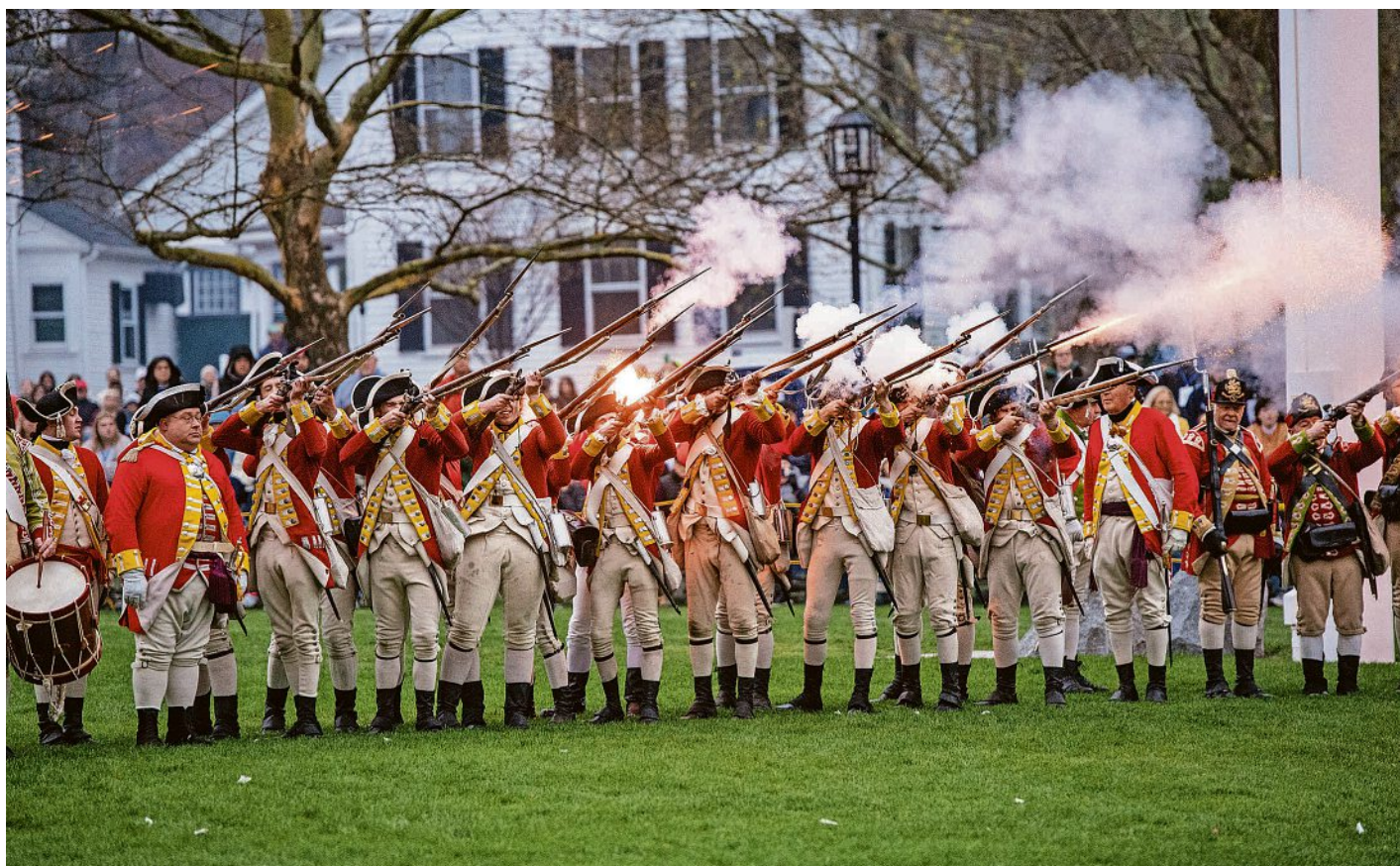
The Battles of Lexington and Concord are reenacted during Patriot's Day celebrations in Massachusetts on April 18. Americans still look to the Founding Fathers for inspiration – but they themselves didn't always agree on the revolution's meaning.