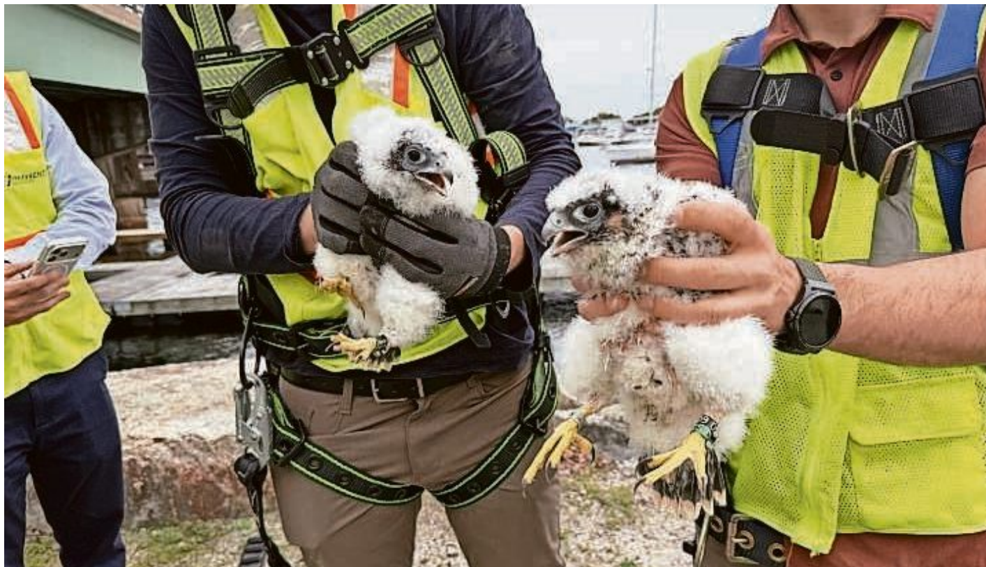
On May 27, at the Gillis Bridge in Newburyport, the Massachusetts Department of Transportation and MassWildlife banded four recently hatched peregrine falcon chicks. Efforts are being made to protect these birds by building nesting boxes around the state.