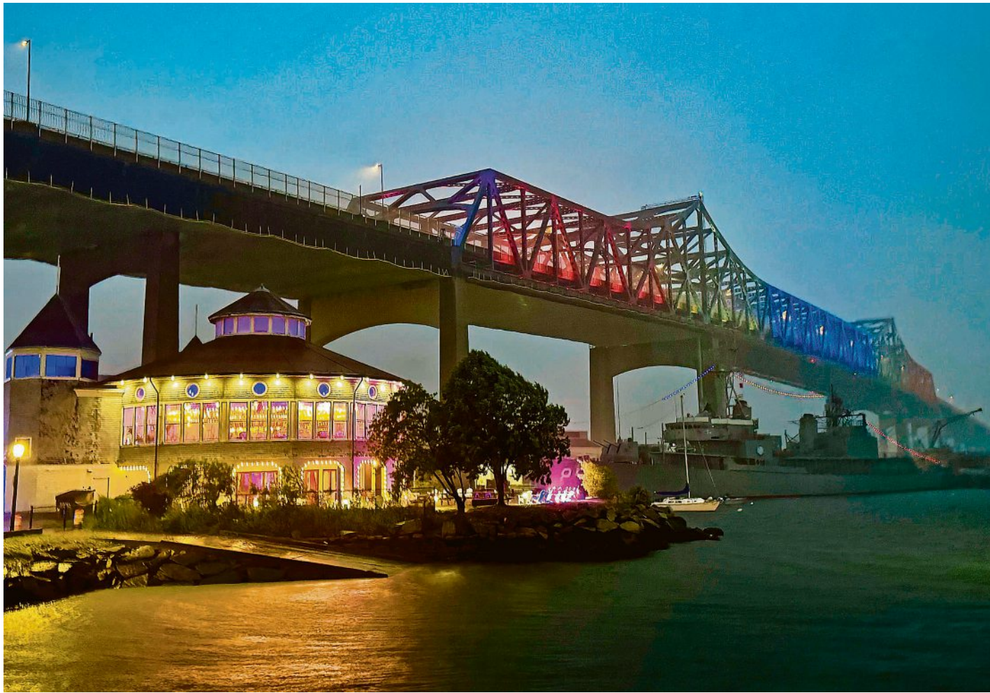
The Braga Bridge is lit up in red, white and blue after being officially switched on by state and local officials in a ceremony in Fall River on July 7.