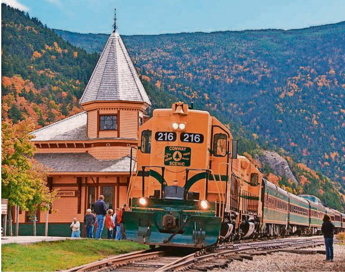
The Conway Scenic Railroad is a great way to see the White Mountains.