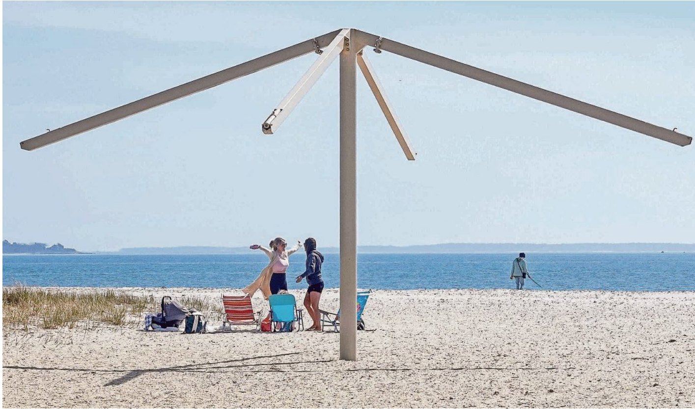
Two friends greet each other on Dowses Beach in Osterville before sitting down to enjoy the warm sun Tuesday morning, on April 14.