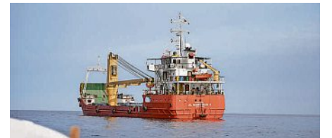
Iran announced on April 17 that the Strait of Hormuz is opened to commercial vessels following a ceasefire agreement between Israel and Lebanon.