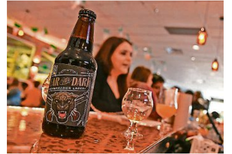
A bottle of Red River Brewing Company's Fear the Dark, a dark, refreshing German lager with notes of coffee and chocolate, sits on the brewery bar in Shreveport in 2019.